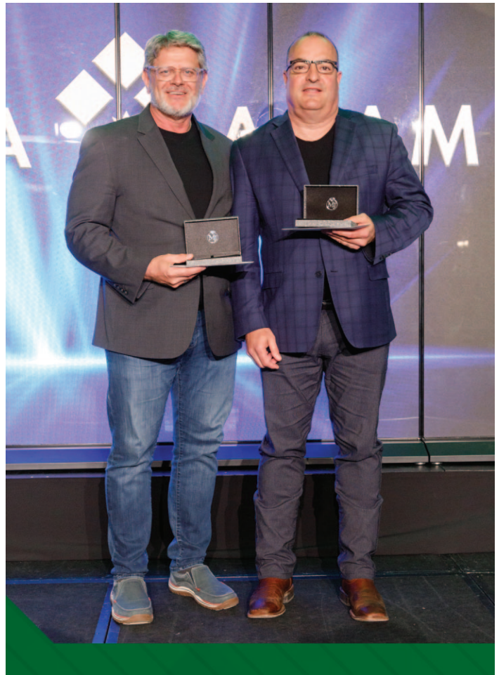
30 Year Recipients

*Please note that the District of Saanich, award recipient, were unable to be in attendance.