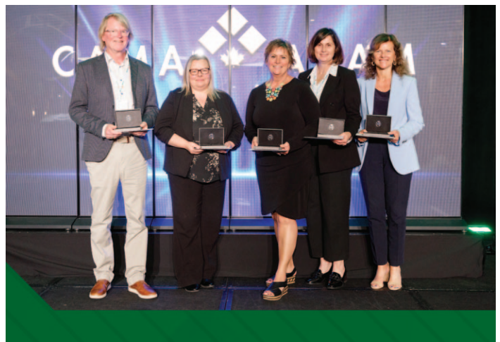
25 Year Recipients