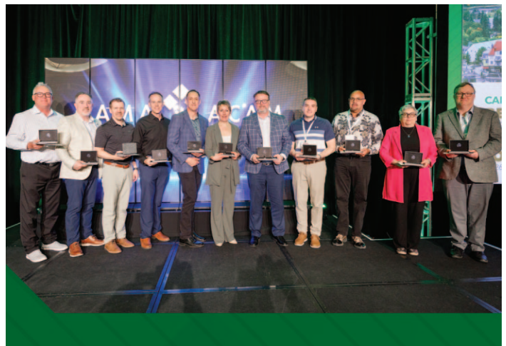
20 Year Recipients